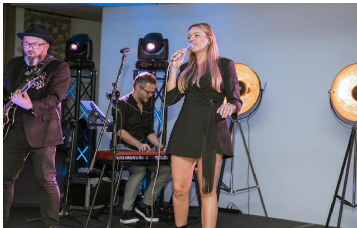
The event also featured a live musical performance.