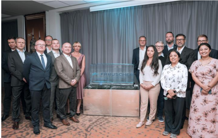
Group picture of the Frauscher Poland team and GSC members taken during the celebration of the 25 year anniversary of Frauscher Poland.